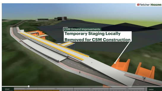
TE-0350 Fiji Bridges 4D call outs V4.mp4