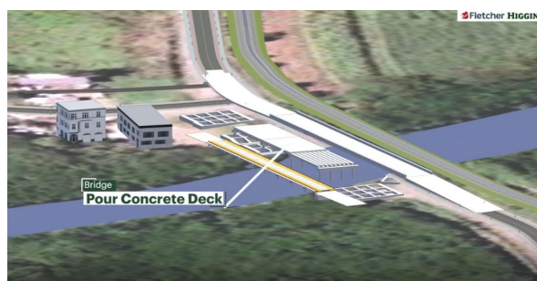
Image: Examples of 4D visualisations for bridge building.