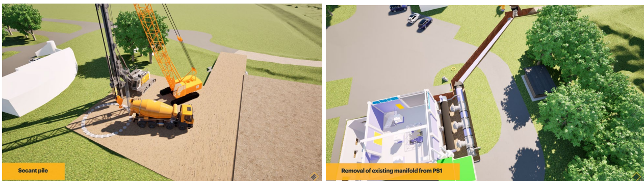
Image: Screenshots of a recent BPC WWTP 4D video used in a bid.

BPC East Clive WWTP 4D V2.mp4 is our most recent example of our 4D capability, with improvements and innovations already noted for the next one, this is an exciting space and positions us as leaders among our competition.