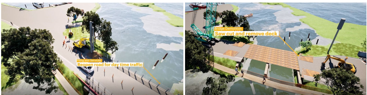
Image: Screenshots of BPC 4D video showing improved modelling and temporary works intent

FLETCHER CONSTRUCTION | BRIAN PERRY CIVIL | HIGGINS